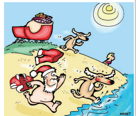
The Aussie spirit of Christmas.

Please bring your own cutlery and plates.