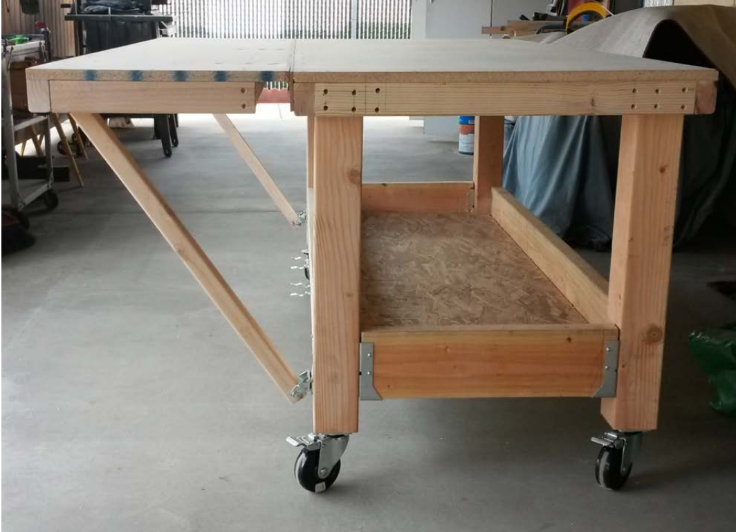
Folding outfeed table?

Looking for new ideas on woodworking or your other hobbies or interests? Try Pinterest. Here are a few workshop ideas I have found useful.