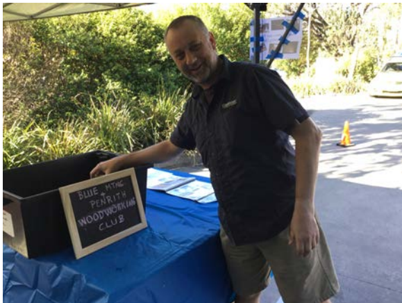
One of the helpful Carbatec staff getting a free drink from the ice